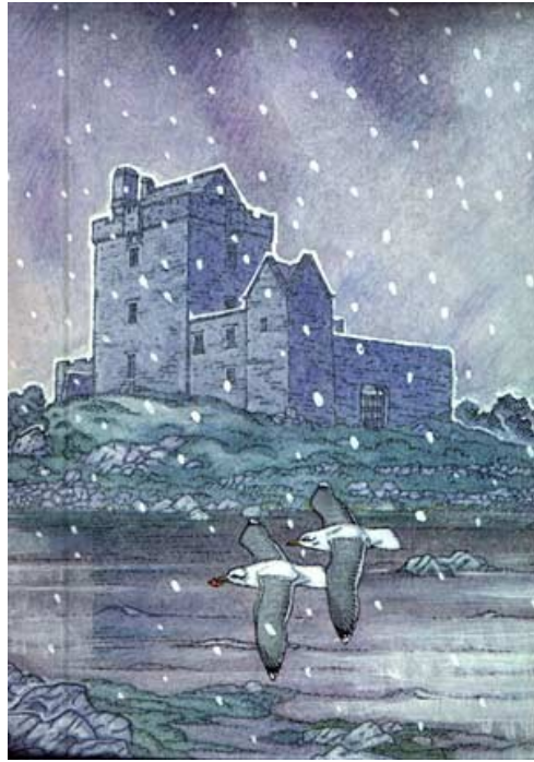
Dun Guaire, 1998