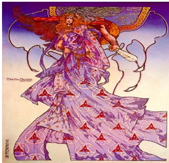
Macha and Nemed, King of Ireland, 1975

Proto-Indo-European (PIE) dialects developed at different rates, resulting from societal growth and migration. Contacts with speakers of earlier substrate languages probably speeded up the process of differentiation and dialect formation. Such processes complicate any analysis for dating proto-languages.