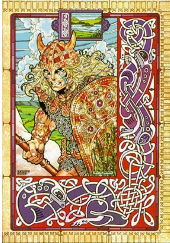
Streng, Champion of the Fir Bolg, 1976 © With the kind permission of Jim Fitzpatrick

Pioneering in nature, Proto-Celts travelled west with Proto-Germans but then continued, on their own, to France, Spain and Ireland. Evidence indicates that Proto-Celts also travelled east, keeping in contact with eastern Indo-Iranians but continuing, on their own, into China.