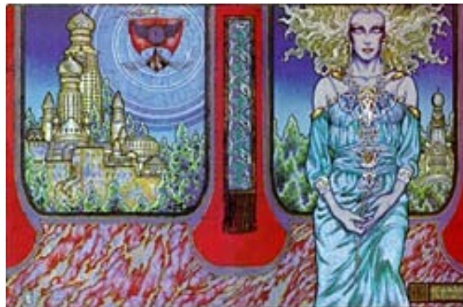
Ethne, Mother of Lugh, 1979

From 7500 to 5500 BC, the Boreal period of the northern hemisphere brought a dry climate to the Baltics, with cold winters and short summers. Hunting in the forests ended dependence on the reindeer. A relatively uniform culture extended from the western Baltic to southwestern Finland. Near to the coastal Ertebølle culture were people of the forest Maglemose culture, who lived in small groups, in the western Baltic area (Latvia). The similar Kunda culture existed on the eastern side (Estonia). The Kunda culture disappeared around 4500 BC with the onset of adverse climate. Overall, hunter-fishermen survived up to 3,400 BC, when climate again improved, prompting fresh migrations to and from the region.